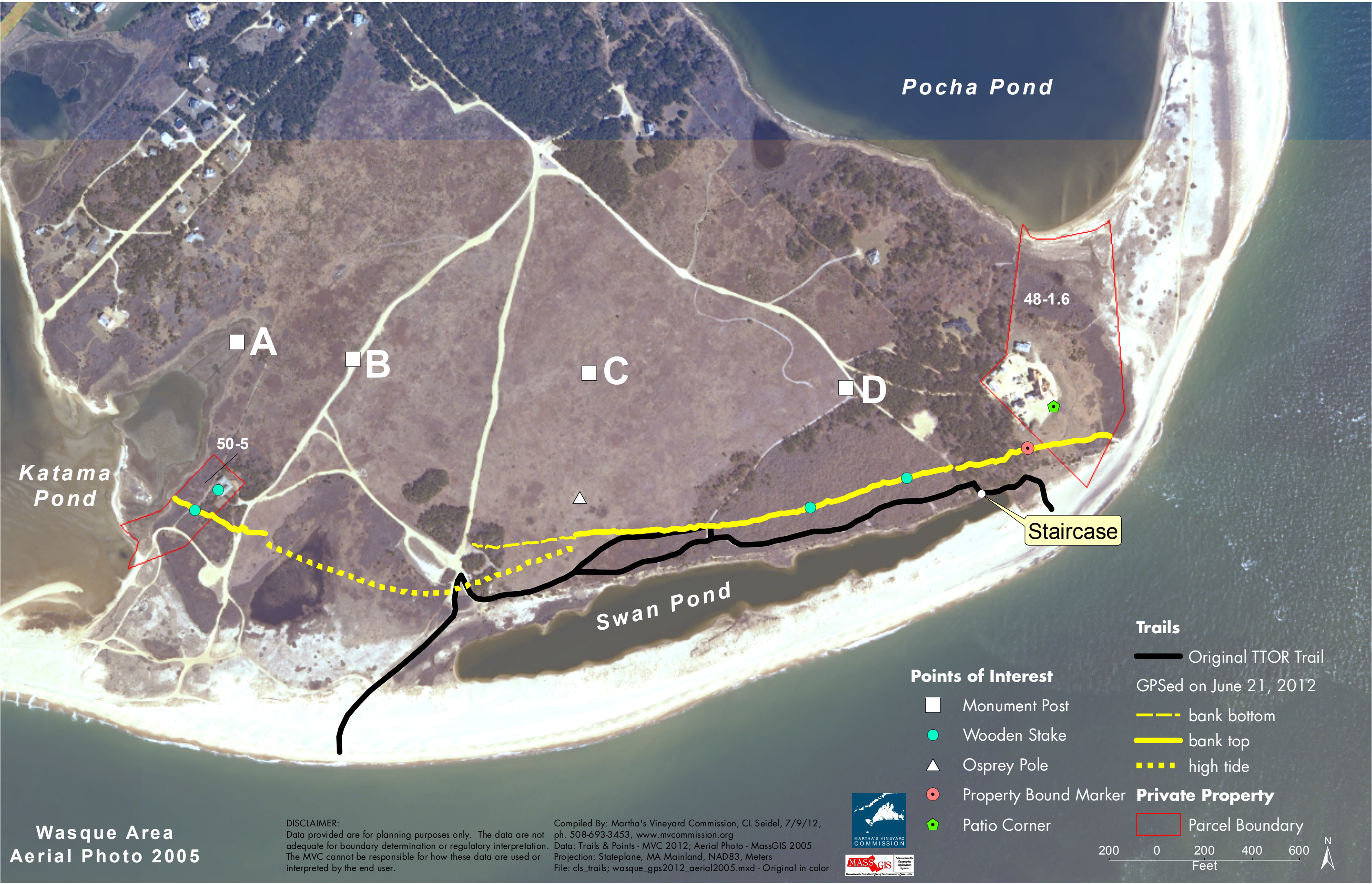
Wasque Area Aerial Photo 2005

DISCLAIMER: Data provided are for planning purposes only. The data are not adequate for boundary determination or regulatory interpretation. The MVC cannot be responsible for how these data are used or interpreted by the end user.