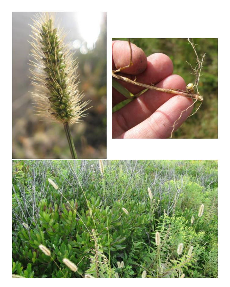
Bristly Foxtail: the hard, knotty rhizome; the inflorescence with golden bristles in the fall; and the habitat mixed with other coastal species including bayberry.

State Status: Special Concern Federal Status: None