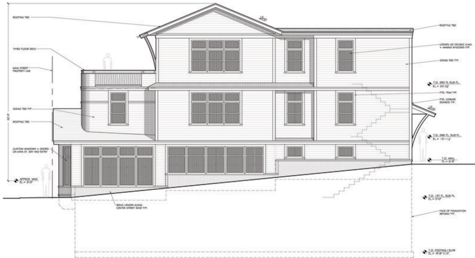
2 NORTH ELEVATION SCALE: 3/16"=1'-0"