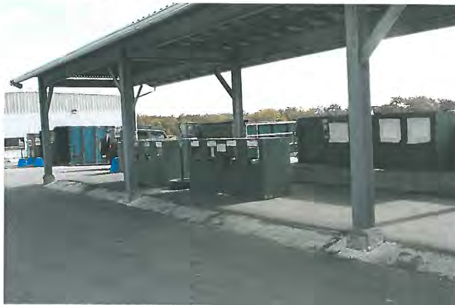
Figure 3. Local Drop off area at District Facility

The primary constraint associated with the local drop off is its location immediately adjacent to the gatehouse, shown on Figure 4, and the limited parking available, resulting in vehicle congestion and excessive queuing even during average operating days. The close proximity of the gatehouse to the drop off area substantially restricts vehicle maneuvering. Room is only available for parallel parking with capacity for up to three or four vehicles. If vehicles double park to use the drop off, it blocks access roadway to the gatehouse and the rest of the transfer station facility, contributing further to the congestion