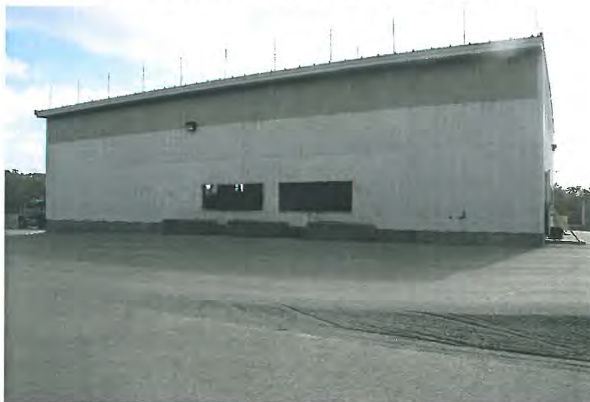
Figure 9. Residential drop off windows at transfer station.

Residents deposit their loads onto the tip floor through windows on the north side of the building (shown in Figure 9). This location of the drop off window is within the traffic lane for trucks and other vehicles that need to access the transfer station tip floor, causing a vehicle conflict and potential pedestrian safety concern. The residential windows and the roof above it are not equipped with gutters, resulting in wet conditions during rain events and icing during the winter season.