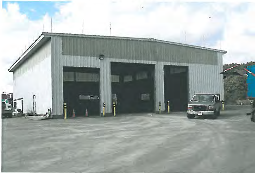
Figure 8. Overhead Doors at Transfer Station

Residents deposit their loads onto the tip floor through windows on the north side of the building (shown in Figure 9). This location of the drop off window is within the traffic lane for trucks and other vehicles that need to access the transfer station tip floor, causing a vehicle conflict and potential pedestrian safety concern. The residential windows and the roof above it are not equipped with gutters, resulting in wet conditions during rain events and icing during the winter season.