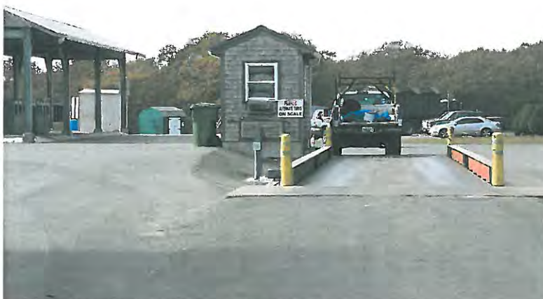
Figure 6. Vehicle queuing at gatehouse/weigh scale.