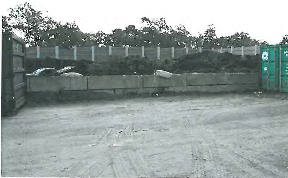
Figure 11. Leaf and yard waste composting area