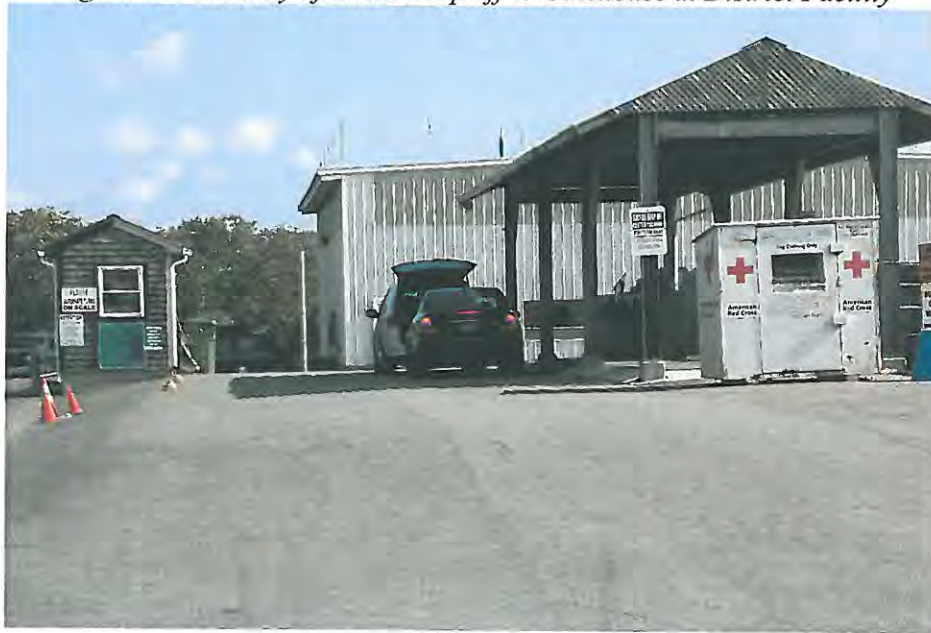
Figure 4. Proximity of Local Drop off to Gatehouse at District Facility

The average use time of the drop off, being the amount of time typically required to perform the recycling drop off activities, is about four minutes/vehicle. During the busier days when 250+ vehicles are using the drop off area a vehicle is arriving an average of every two minutes over the operating day. During peak usage hours this can increase to two or three times this amount, resulting in the extensive queuing that is a major source of frustration for all users of the facility.