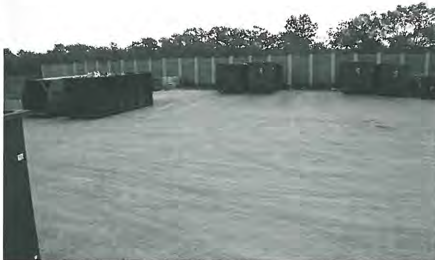
Figure 12. Container storage area.

The container storage area is located adjacent to the compost area and behind the local drop off area. It is used for storage of empty and full roll-off containers that are either fully enclosed boxes or tarped open top boxes.