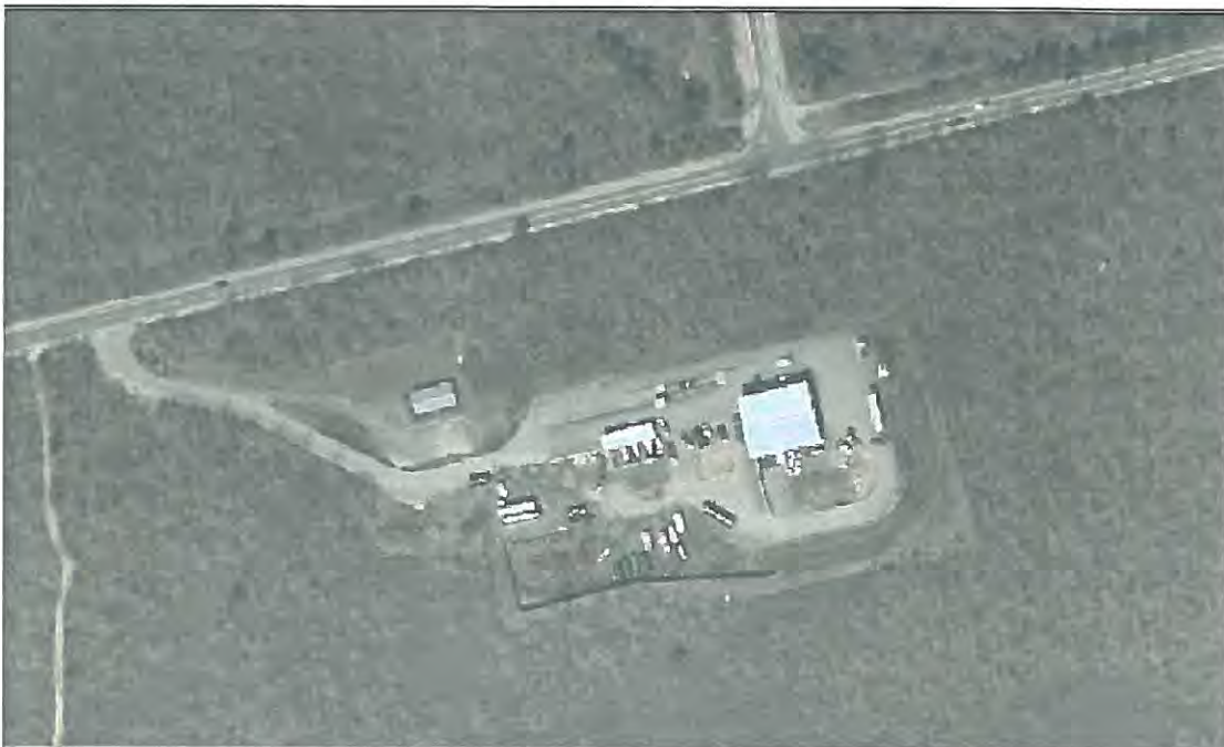
Figure 2. Orthophoto of MVRD facility in Edgartown.

The District facility is accessed by a single access road off of the West Tisbury Road for all incoming and outgoing traffic. An orthophoto of the property and access road location is show on Figure 2. After crossing the 200' perimeter buffer zone, the roadway remains outside the buffer zone in the interior of the property. The District office is located at the entrance of the facility in a separate building with a small parking area.