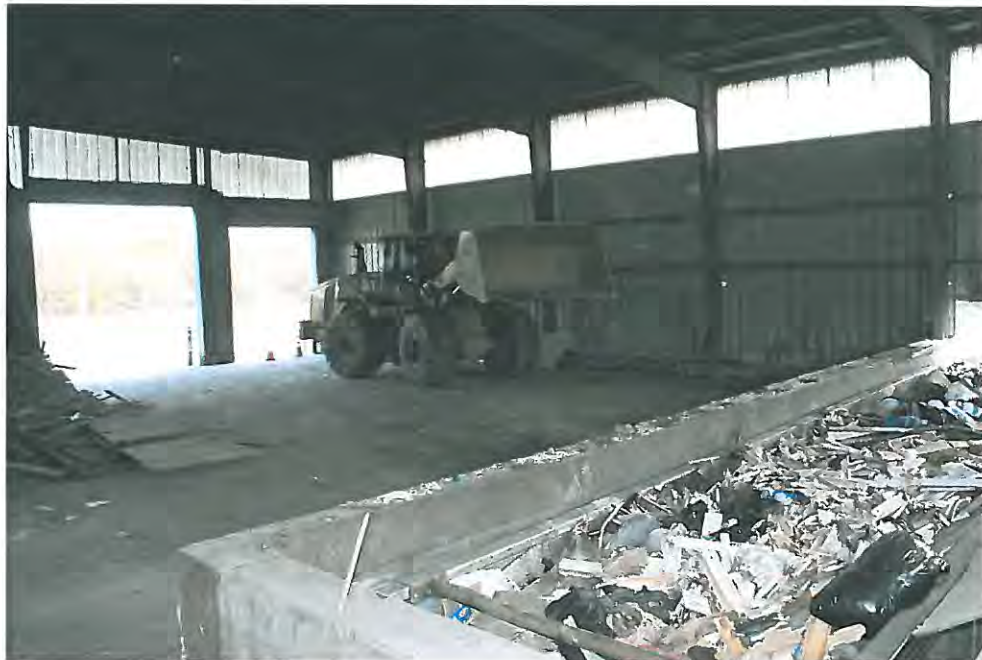
Figure 7. Transfer station tip floor area.

The interior side walls of the station are unprotected building and frame skin, and a concrete push wall is needed to allow the front end loader operations to crush and pile material without damaging the side walls. The staff has therefore added precast concrete blocks along the interior north face of the building. Eight foot cast-in place walls along the north and south interior walls would provide greater operational usage of the tip floor.