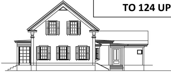
WEST ELEVATION - EXISTING