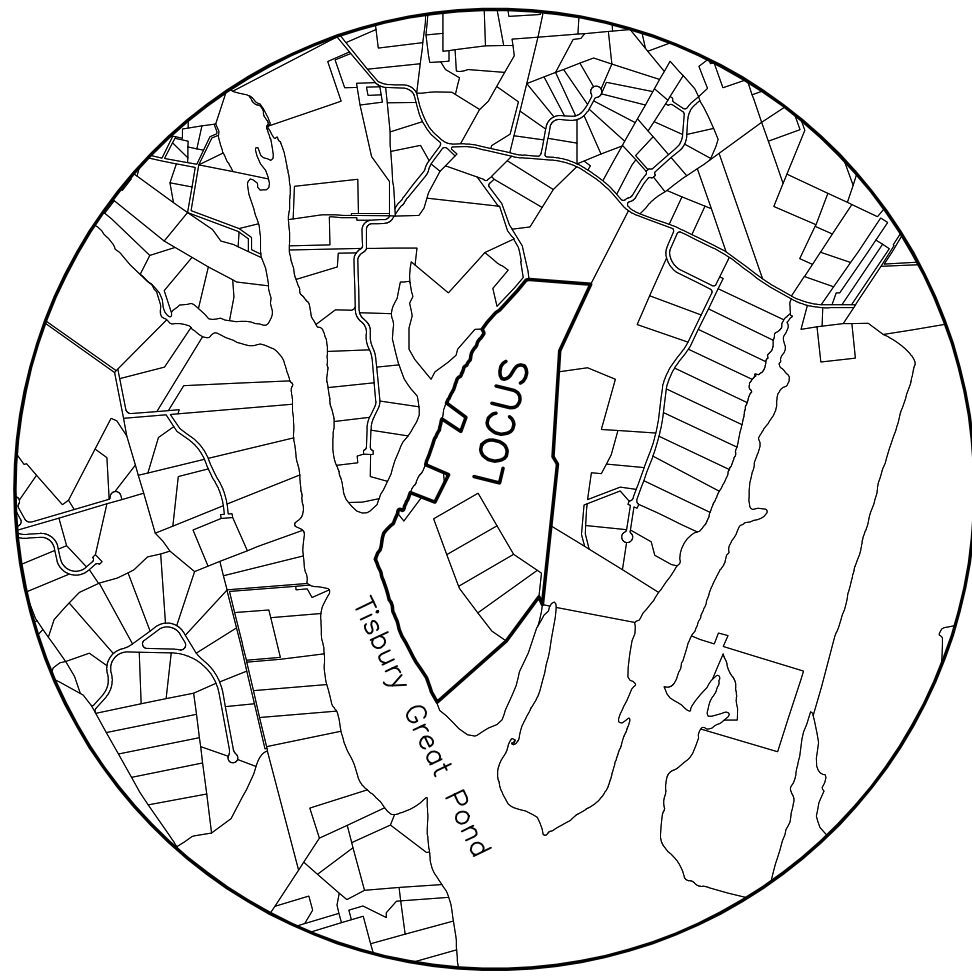
LOCUS MAP 1" = 2000'

Black Property Lines and Areas From 2018 Form B plan Red Property Lines and Areas From 2023 Form C plan