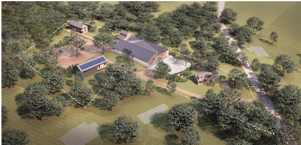
Proposed "The Yard" Expansion, January 2019, Handel Architects

October 1, 2019 – September 30, 2020 Transportation Planning Activities in the County of Dukes County, Massachusetts