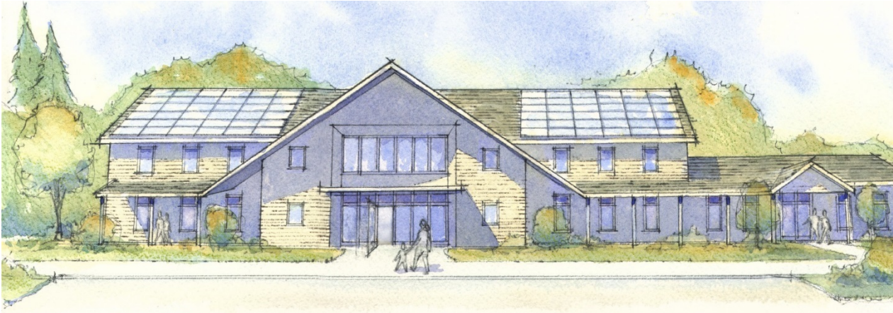
Rendering of the proposed new Martha's Vineyard Community Services in Oak Bluffs. March 2019, The South Mountain Company

MARTHA'S VINEYARD COMMISSION BOX 1447, OAK BLUFFS, MASSACHUSETTS, 02557 508-693-3453 FAX 508-693-7894 info@mvcommission.org www.mvcommission.org