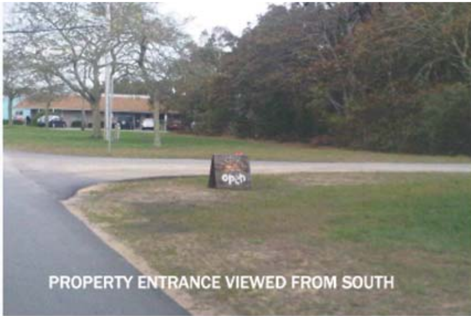
PROPERTY ENTRANCE VIEWED FROM SOUTH