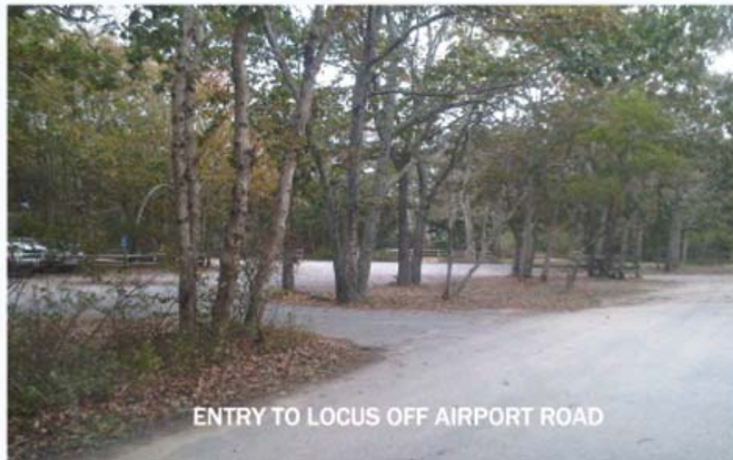
ENTRY TO LOCUS OFF AIRPORT ROAD