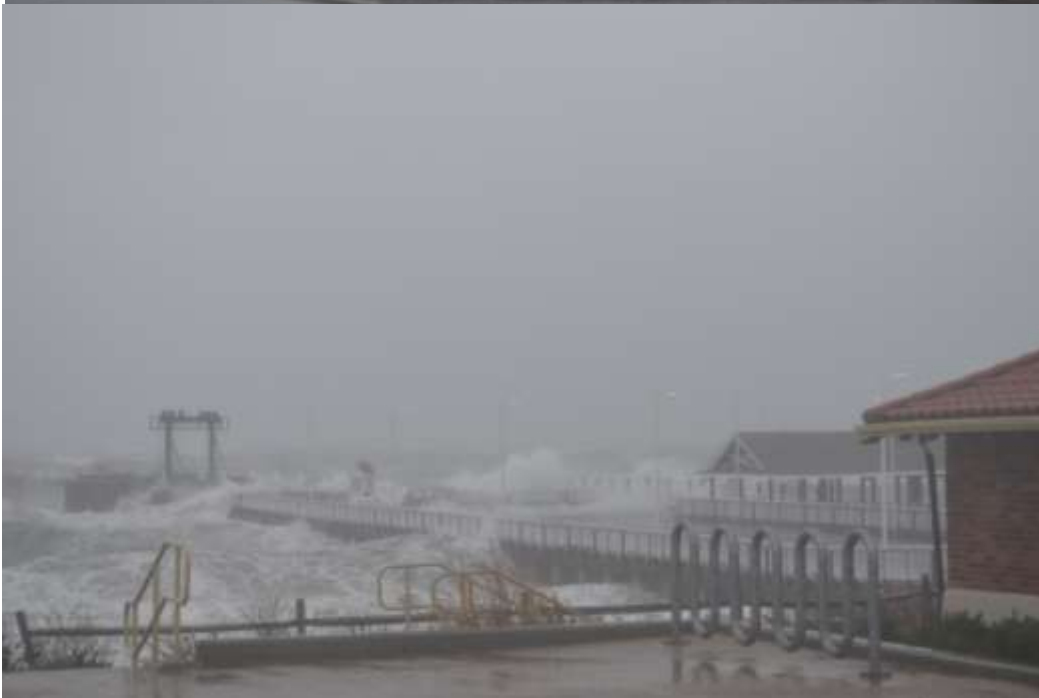
OAK BLUFFS STEAMSHIP AUTHORITY PIER HURRICANE SANDY 2012