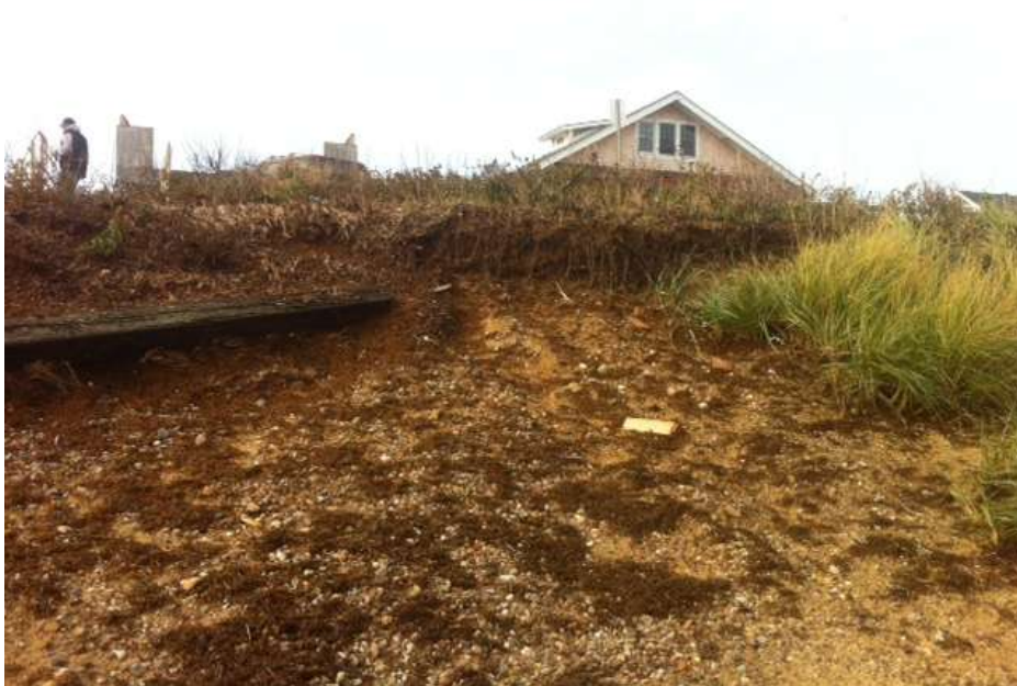
NORTH BLUFF BANK DAMAGE DUE TO HURRICANE SANDY 2012