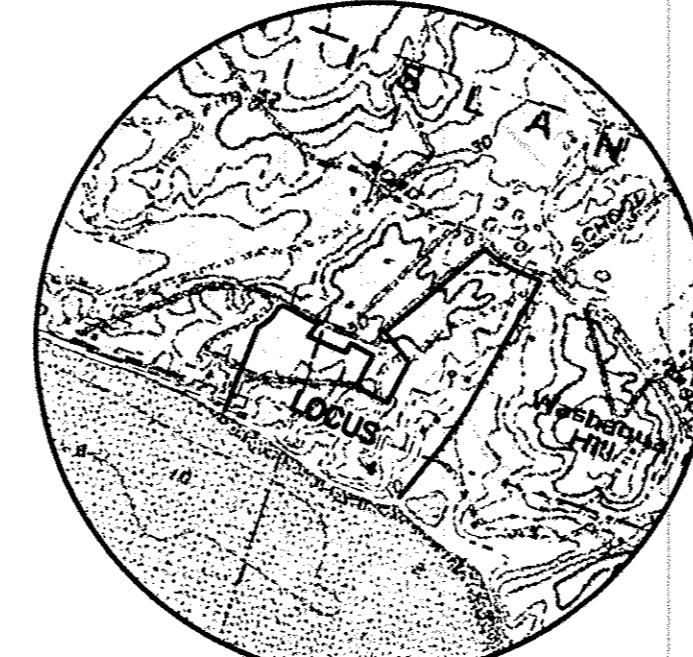
LOCUS MAP 1:25,000

Assr. No. 34-257 Vincent Liuzzi, Trustee