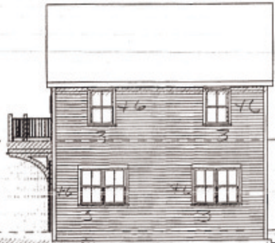
SOUTH ELEVATION 18' x 10'

FERRY RAQUETBALL COURT STATE ROAD, WEST TISBURY, MA WEST TISBURY, MA 01561 EXTERIOR ELEVATIONS