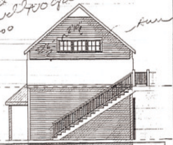
NORTH ELEVATION 18' x 10'