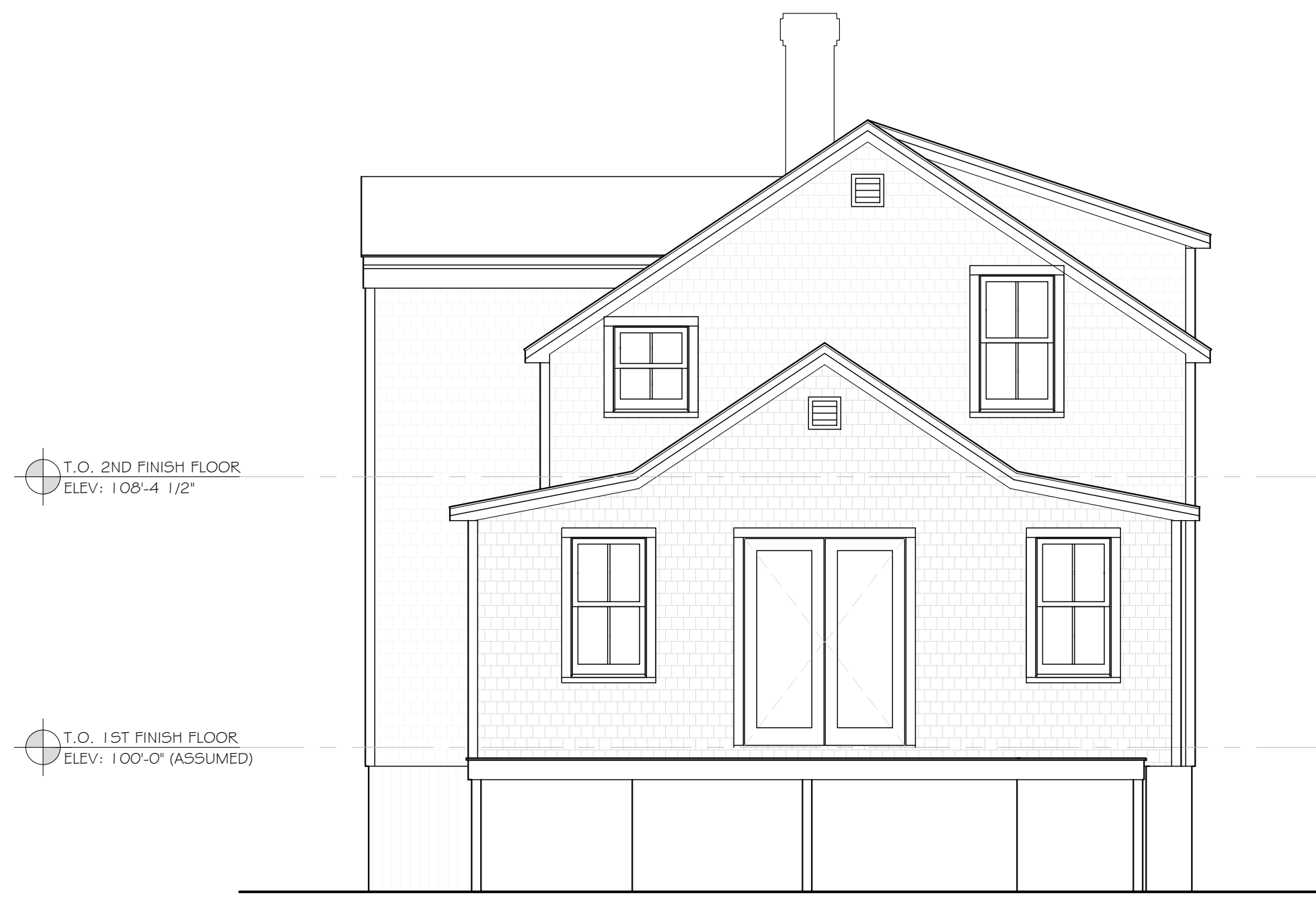
1 EXTERIOR FRONT ELEVATION