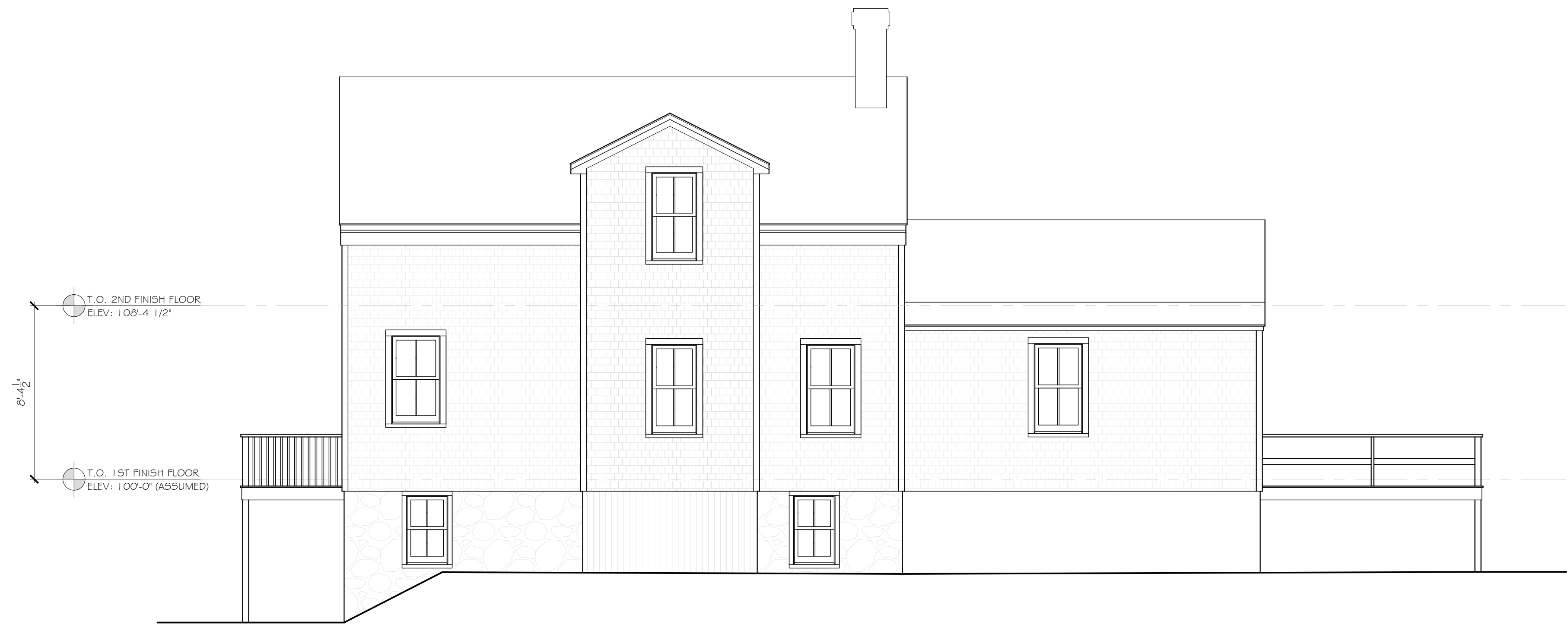
2 EXTERIOR SIDE ELEVATION