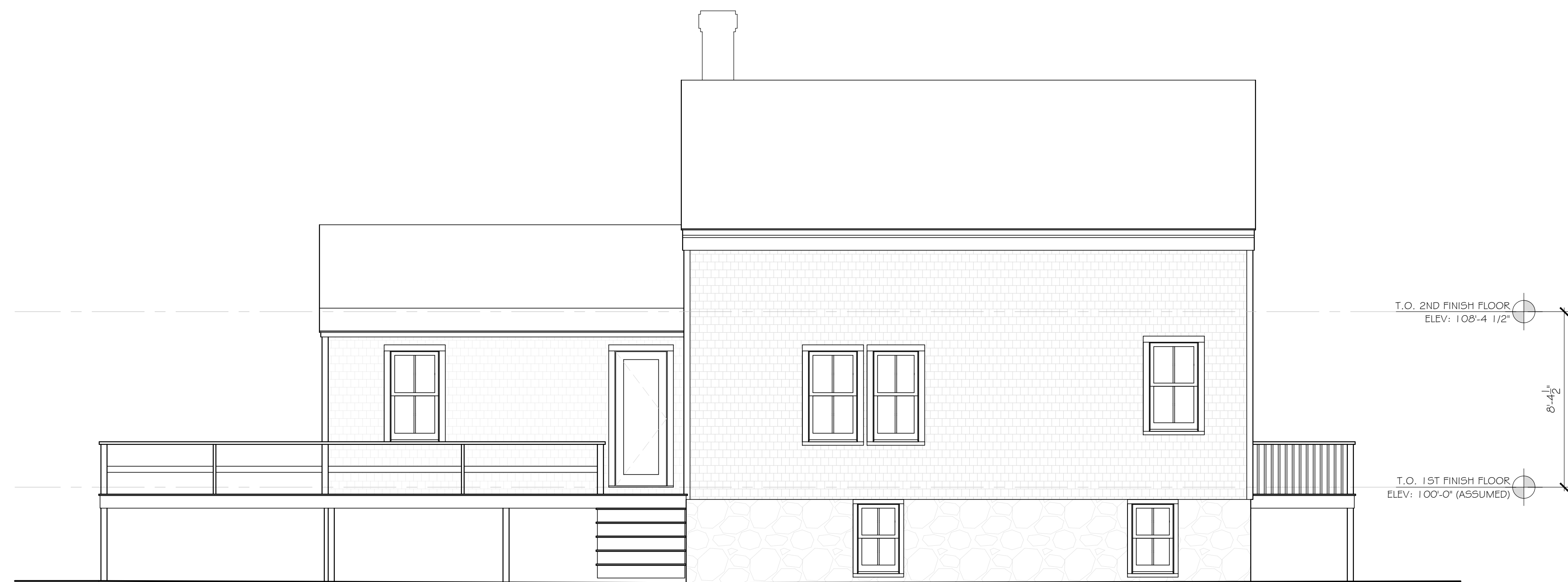
3 EXTERIOR SIDE ELEVATION