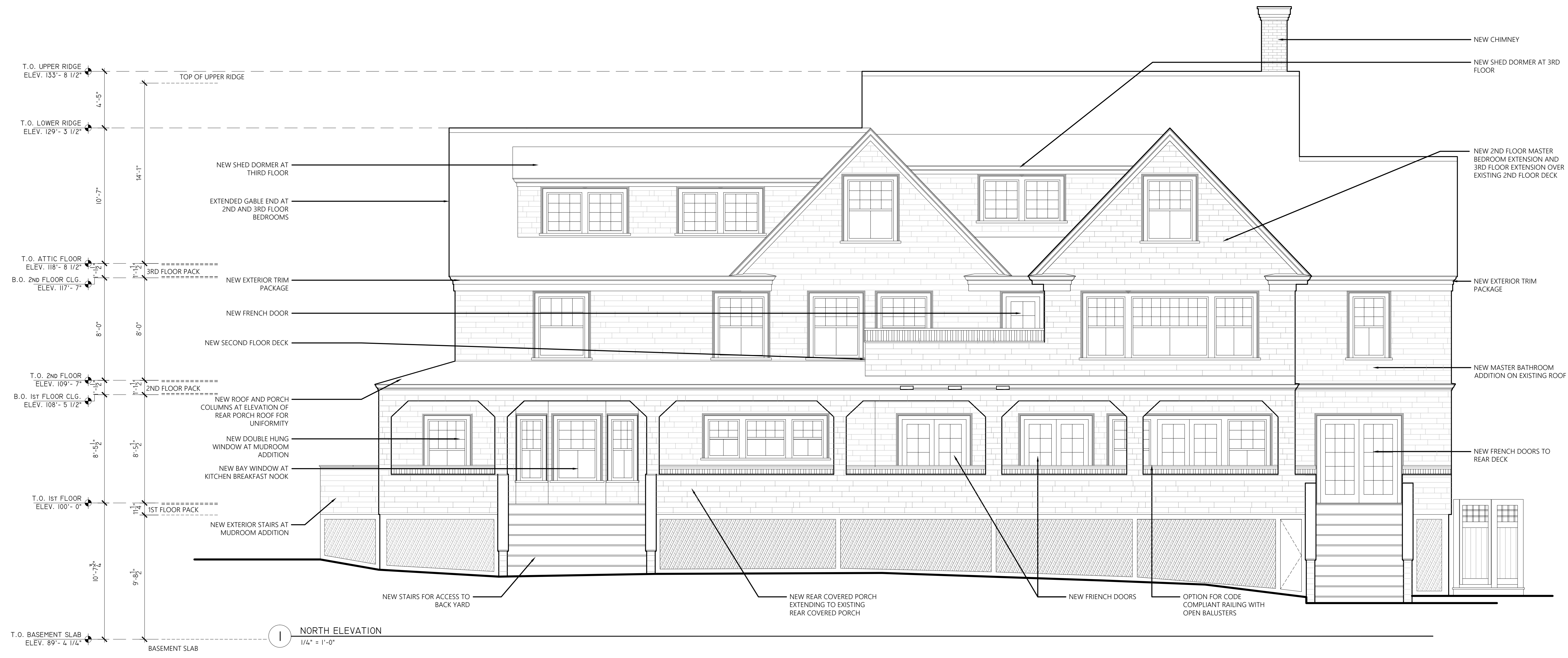
NORTH ELEVATION 1/4" = 1'-0"