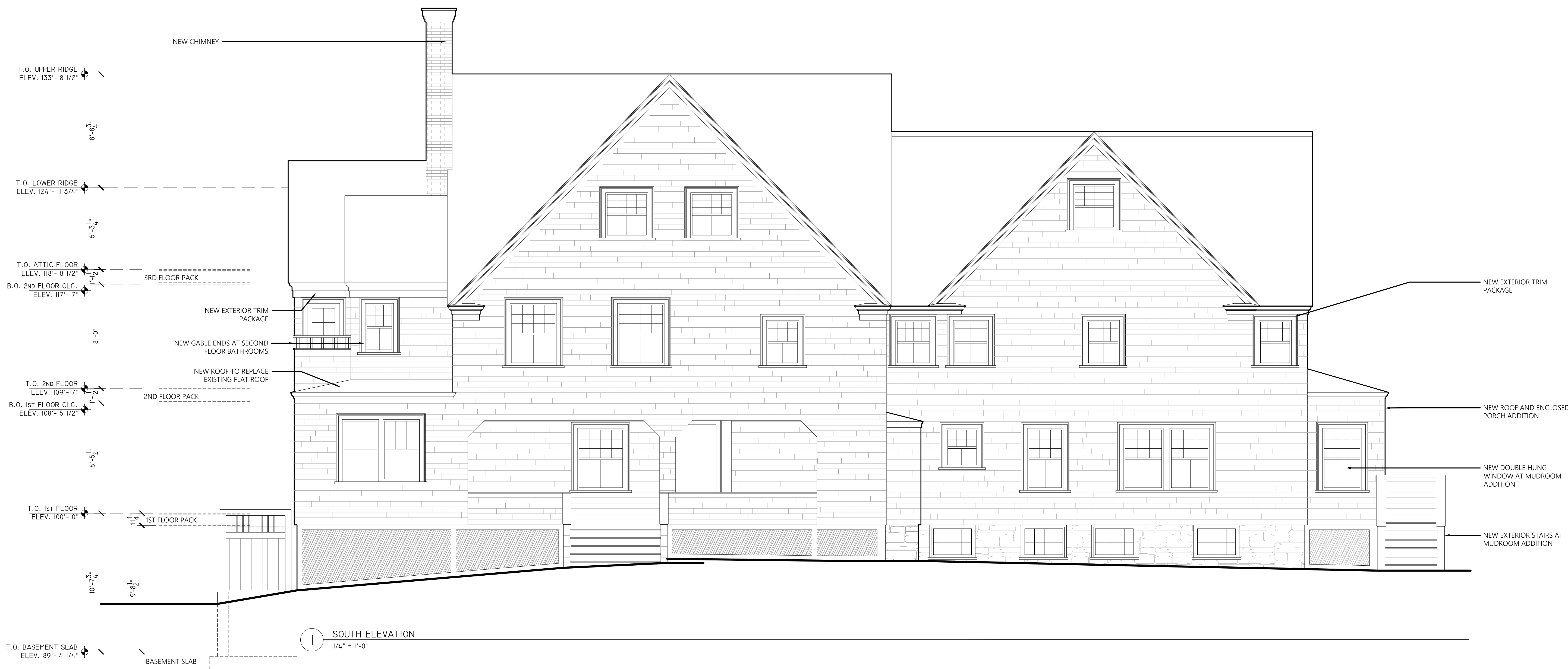
I SOUTH ELEVATION 1/4" = 1'-0"