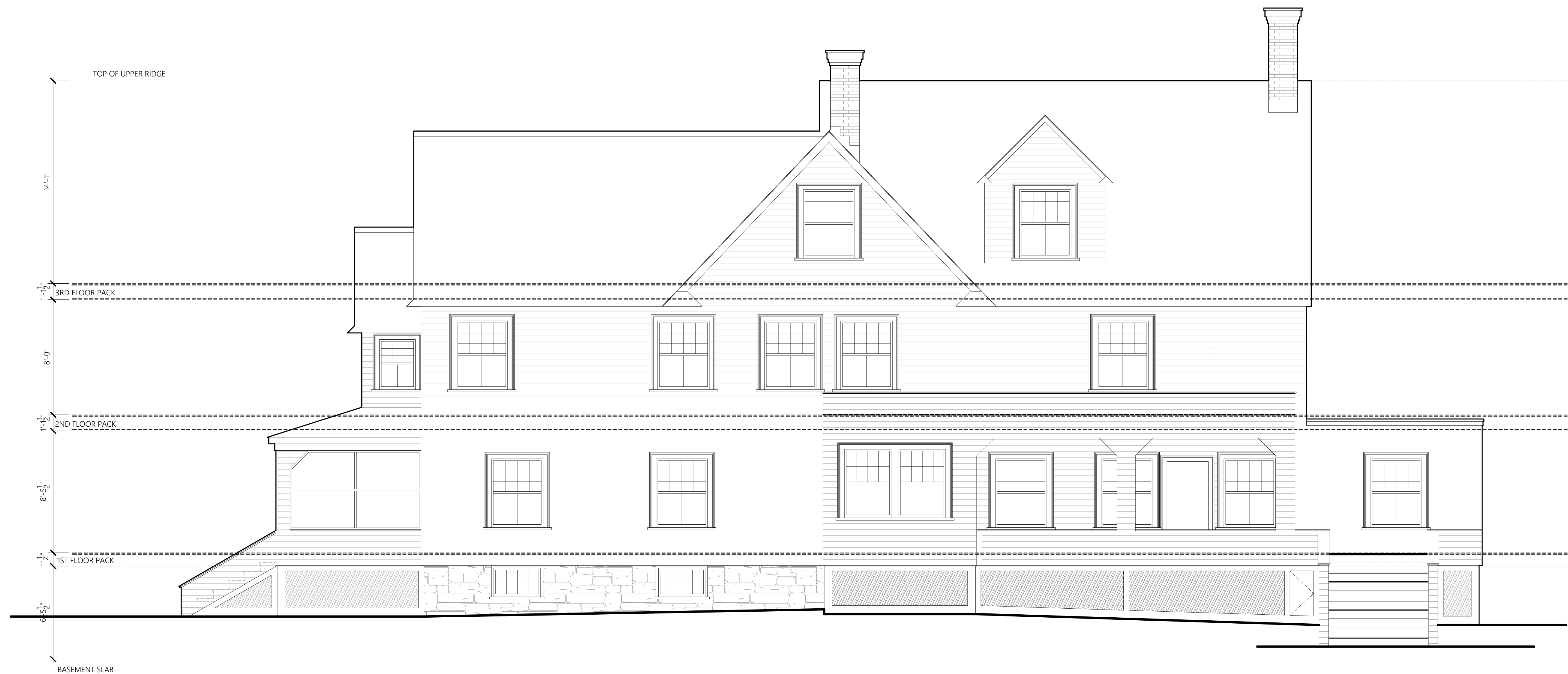
1 EXISTING NORTH ELEVATION 1/4" = 1'-0"