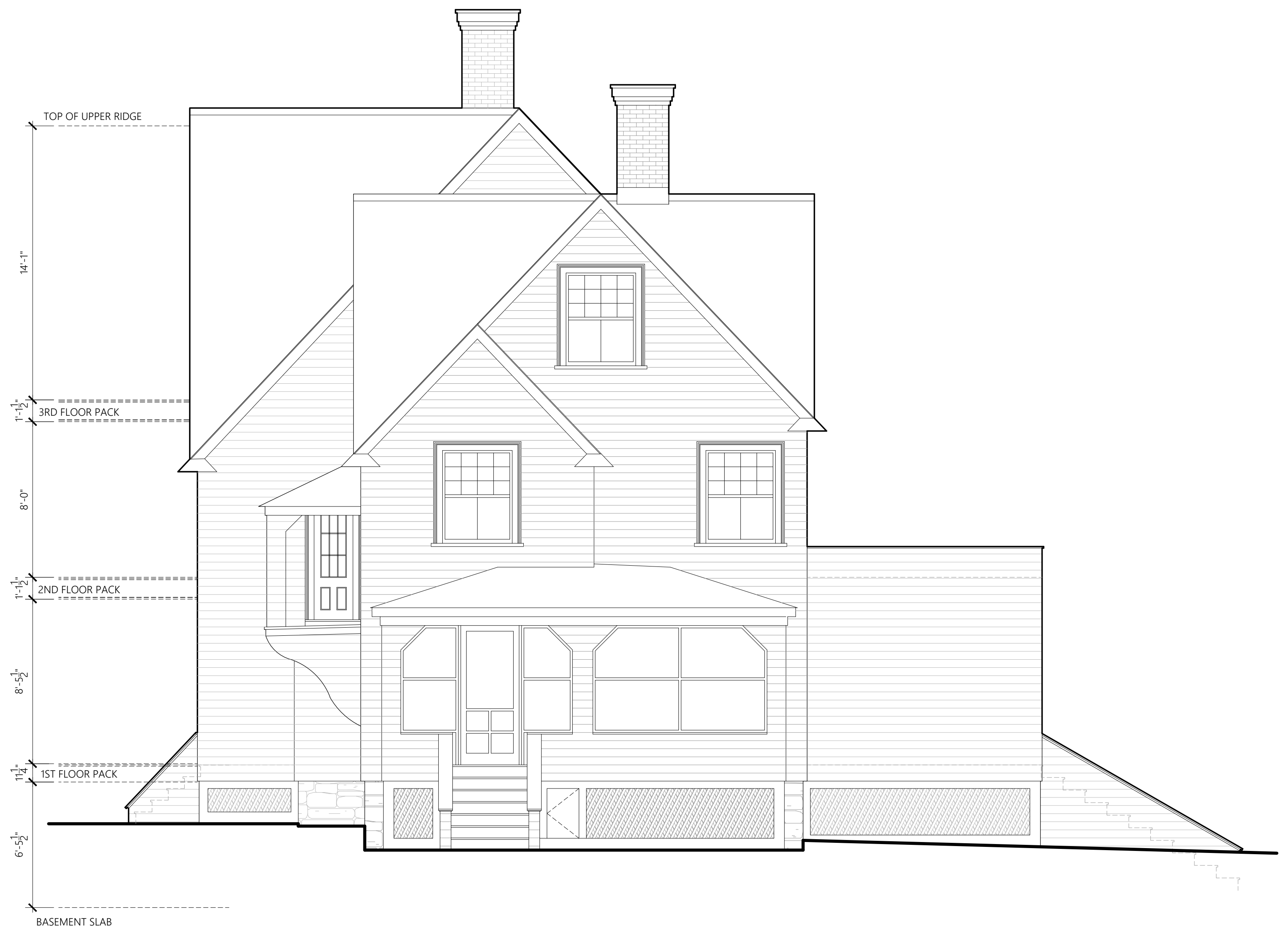
2 EXISTING EAST ELEVATION 1/4" = 1'-0"