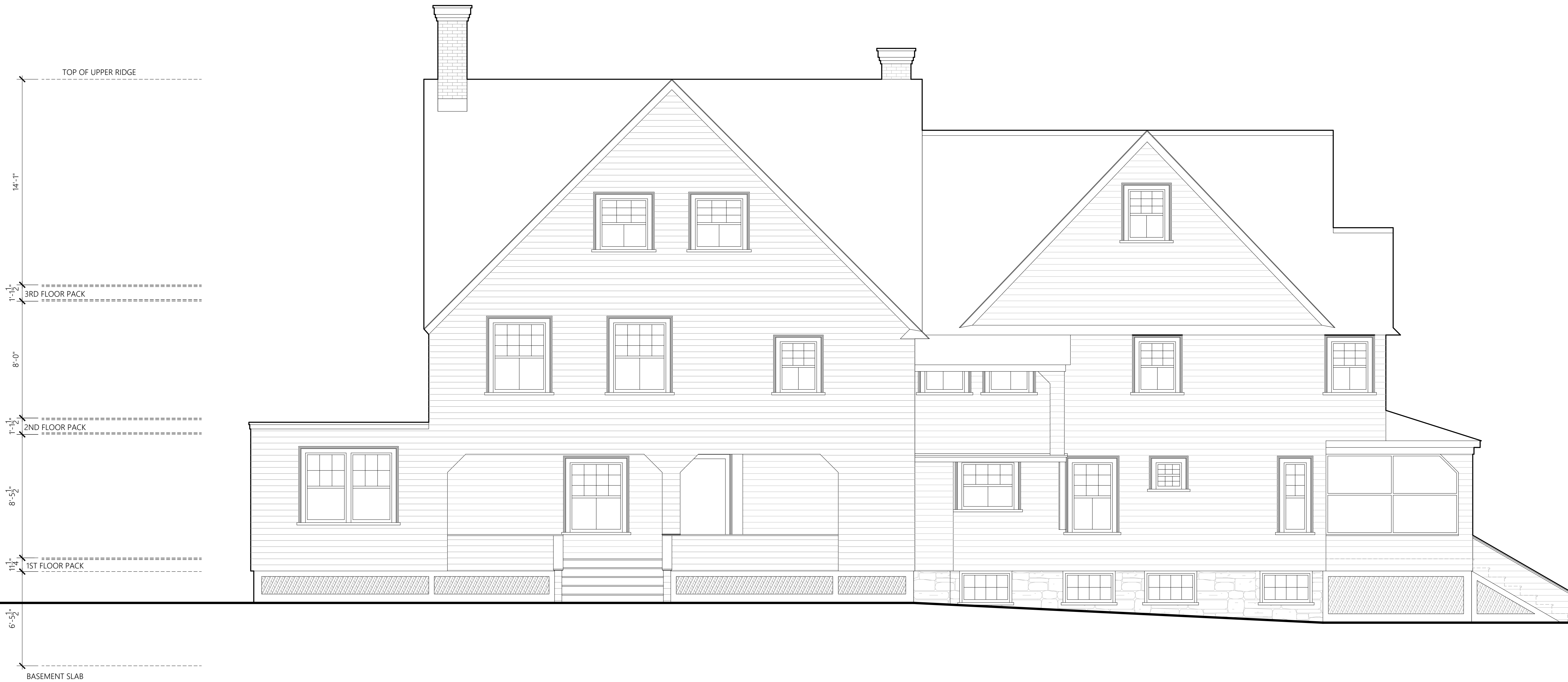
1 EXISTING SOUTH ELEVATION 1/4" = 1'-0"