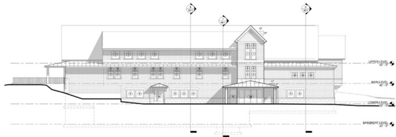
A SOUTH ELEVATION 3/8" = 1'-0"