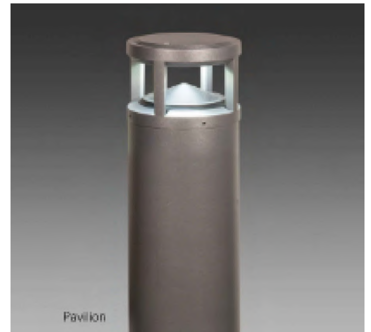
"B1-3HS" KIN LIGHTING PAVILION ROUND