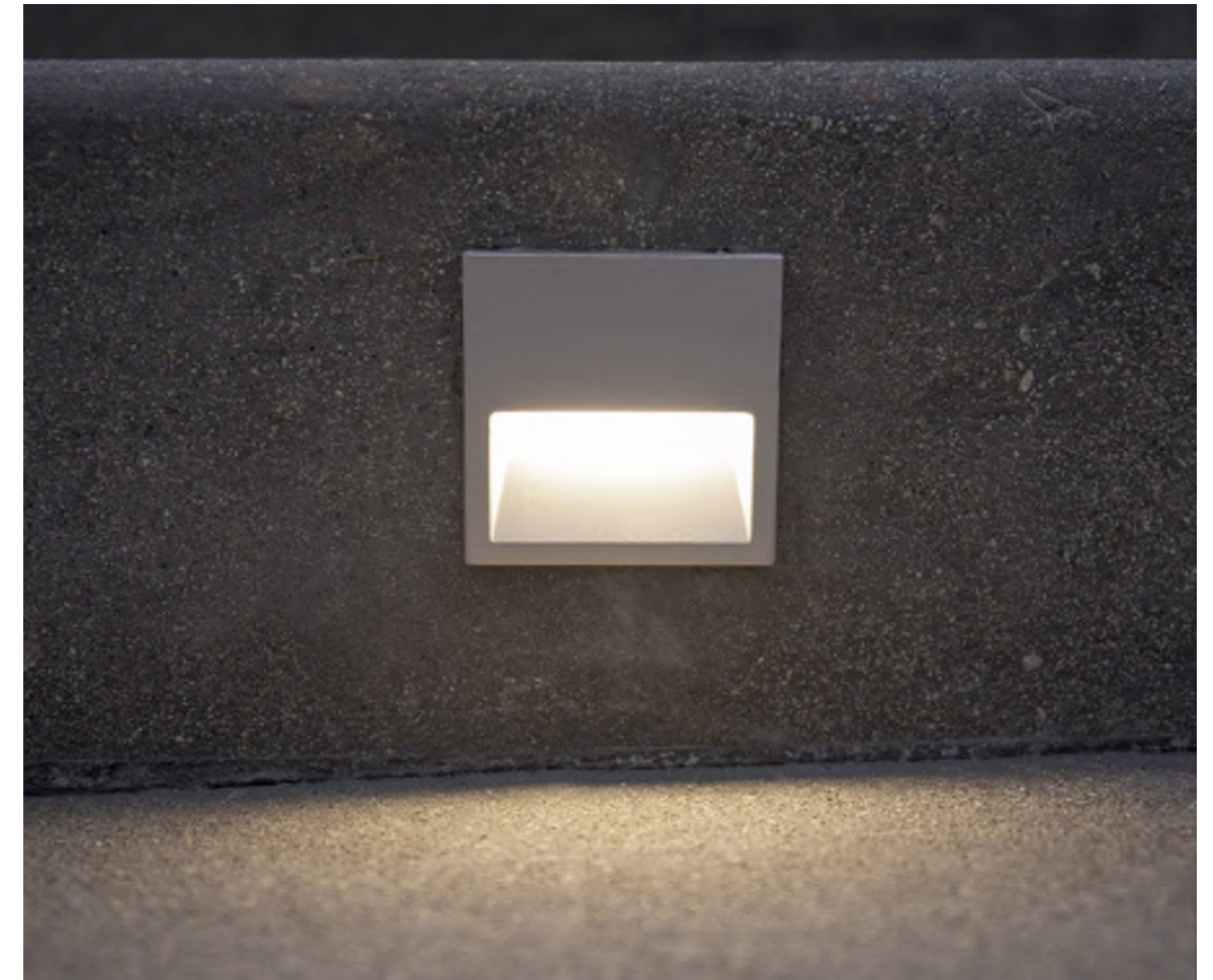
"W2-FW" TARGETTI ZEDGE-MINI