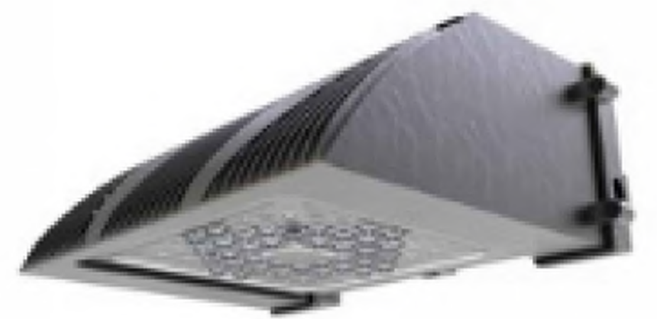
"W1-3" BEACON TRAVERSE

Existing YMCA Building FF = 97.16' LL = 85.15'