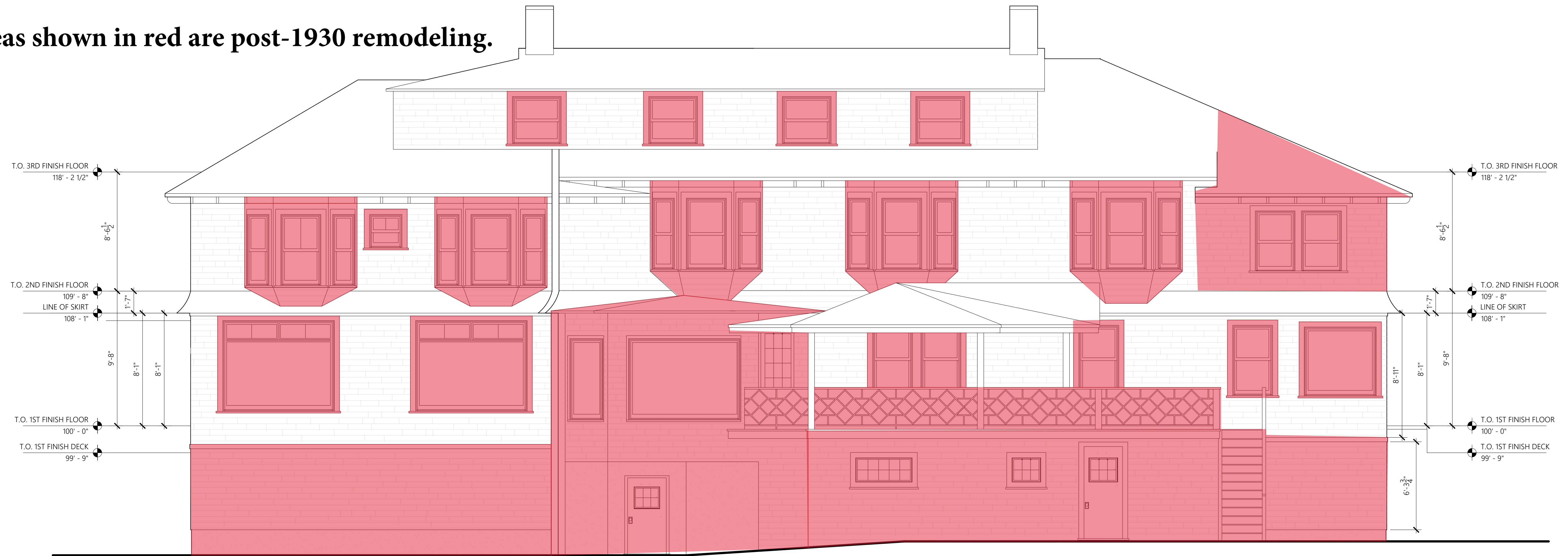
2 EXISTING WEST ELEVATIONS SCALE: 1/4" = 1'-0"

All areas shown in red are post-1930 remodeling.