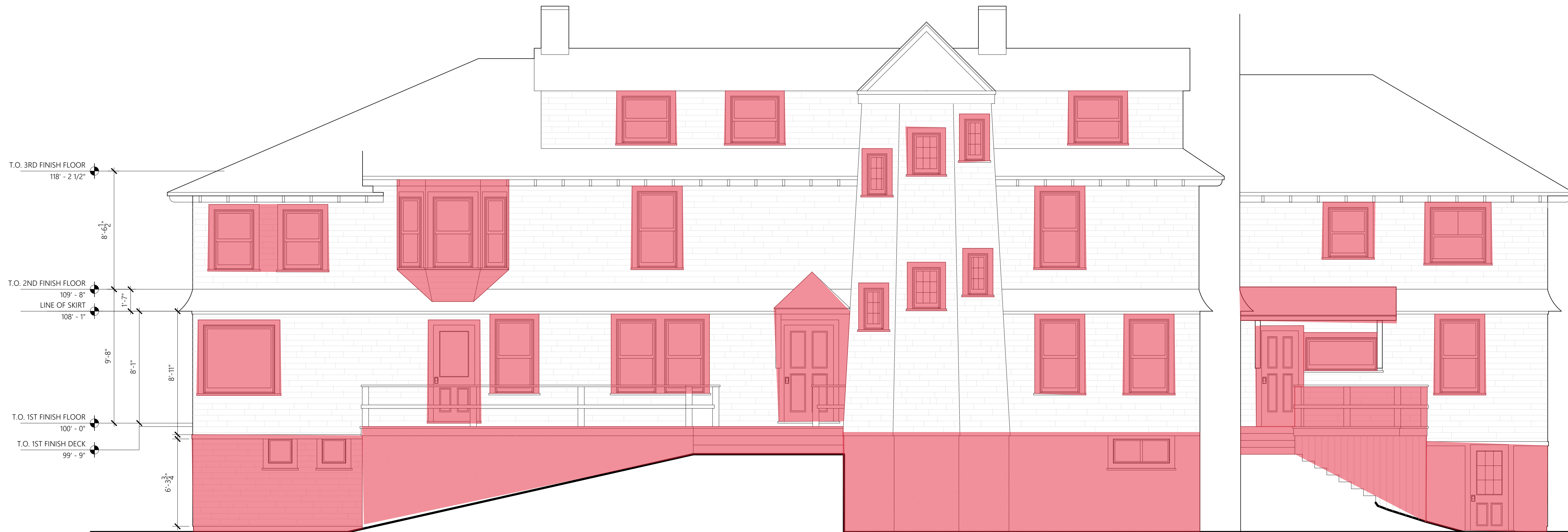
1 EXISTING EAST ELEVATIONS SCALE: 1/4" = 1'-0"