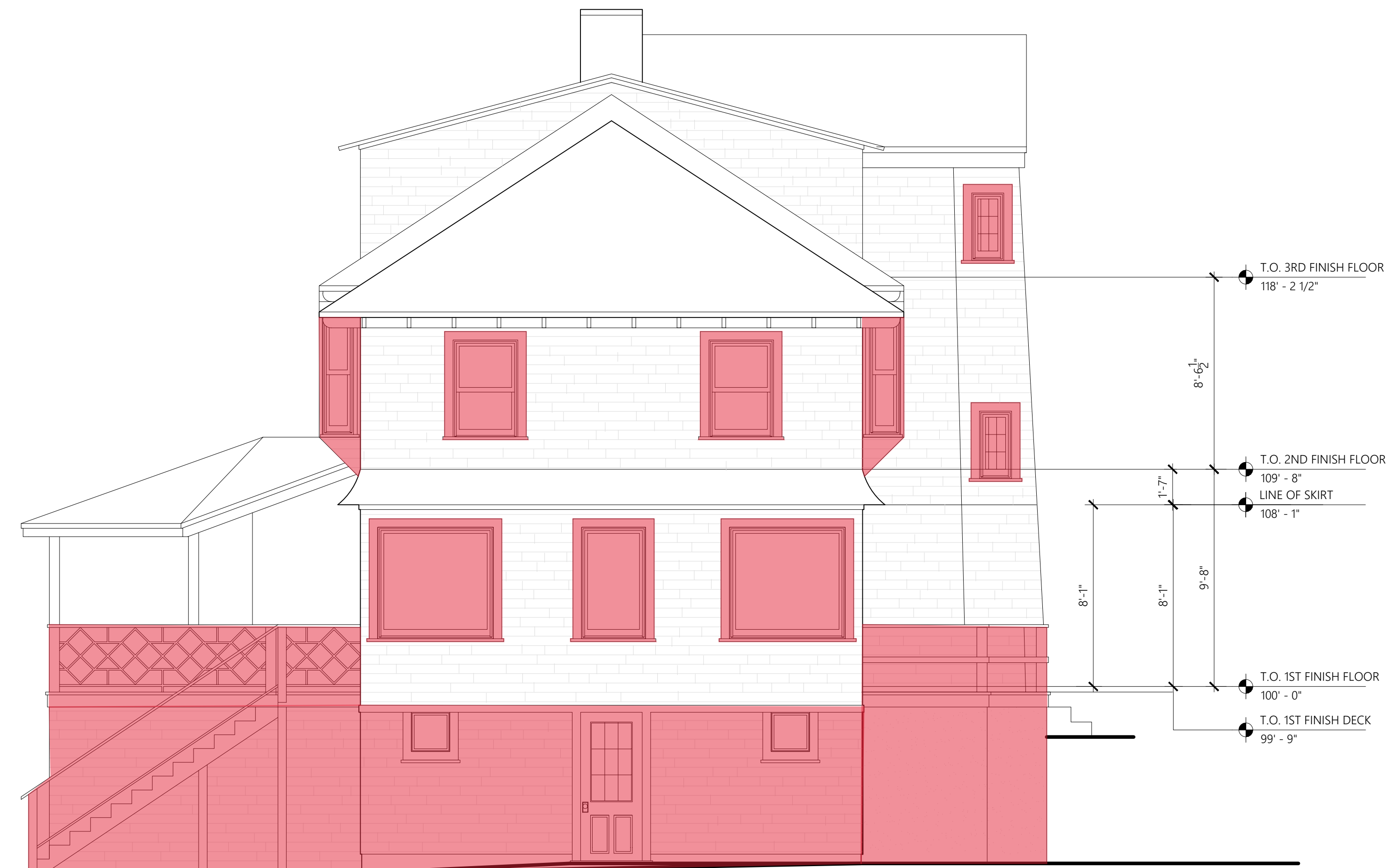
1 EXISTING SOUTH ELEVATIONS SCALE: 1/4" = 1'-0"