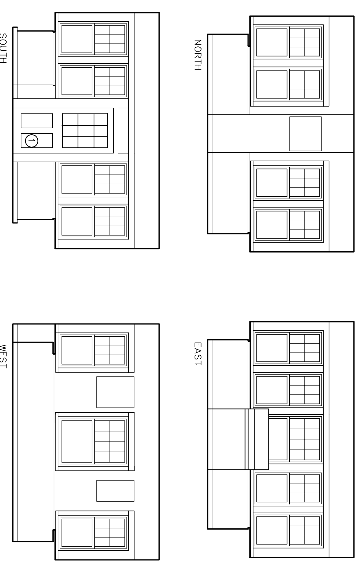
INTERIOR ELEVATIONS SCALE: 1/4"=1'-0"