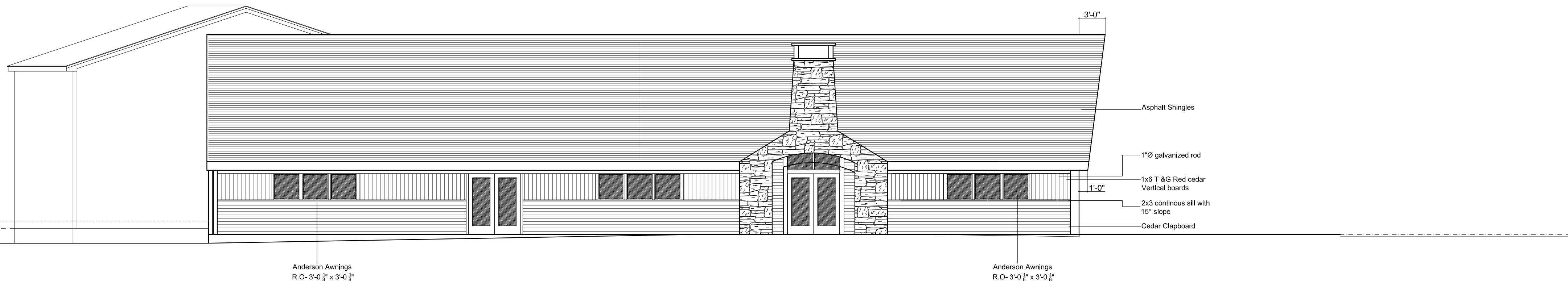
Proposed East Elevation Scale: \frac{1}{8}''=1'-0''