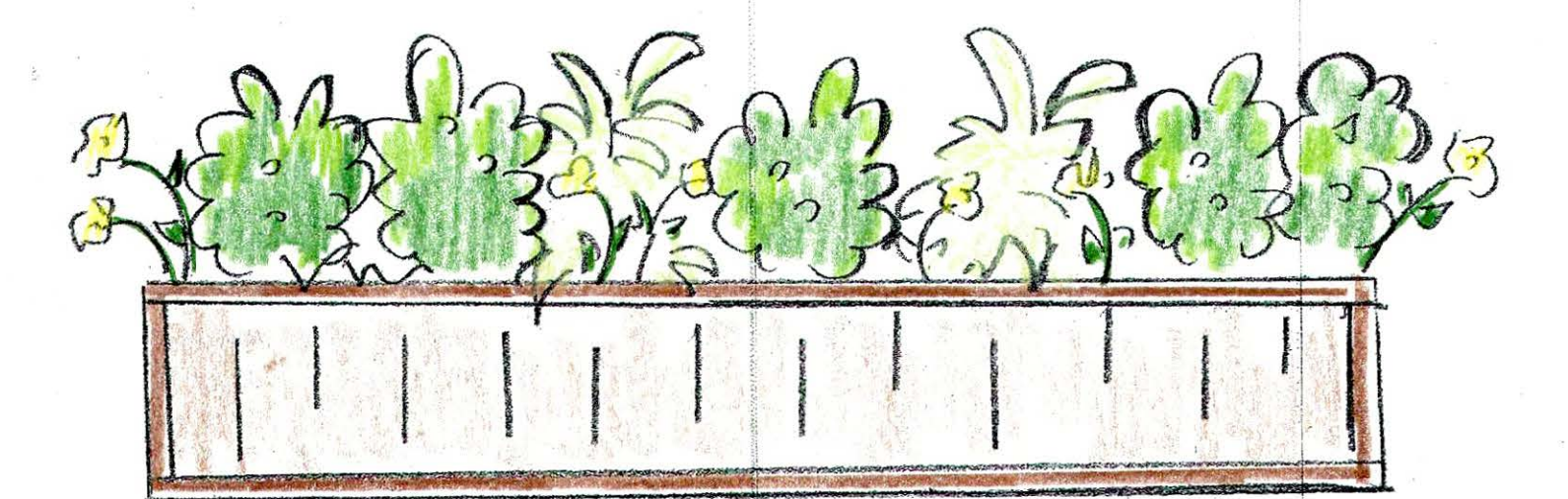
PLANTER DETAIL 1/2" - 1' - 0"