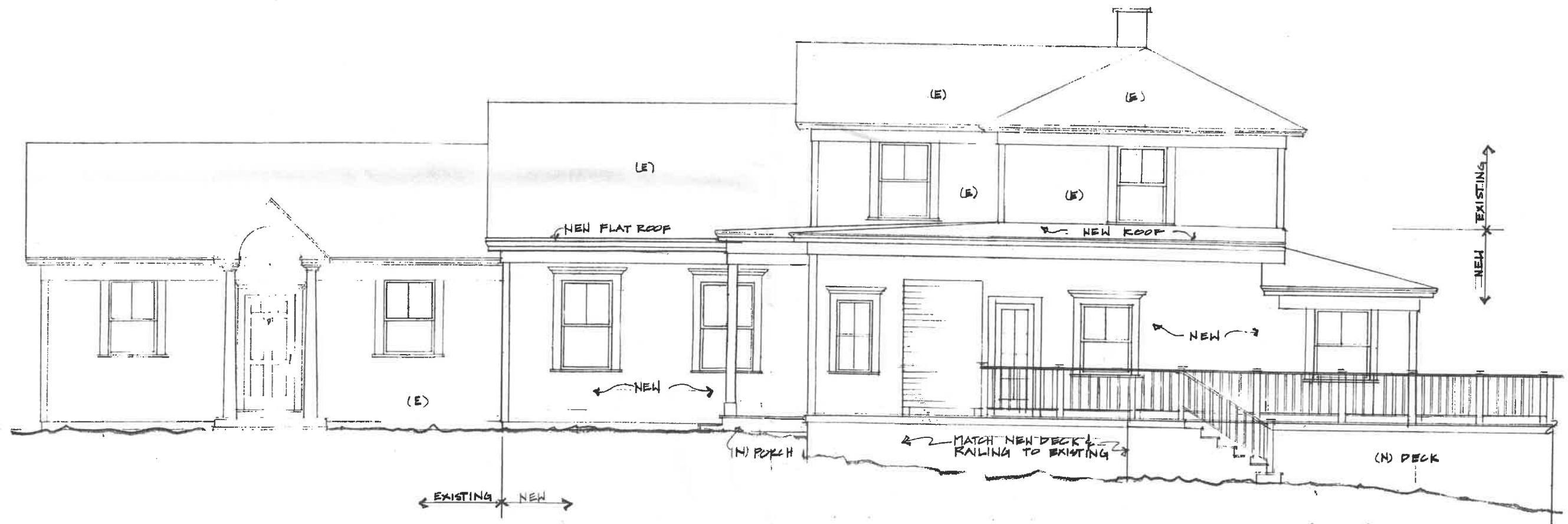
S O U T H E L E V A T I O N 1/4" = 1'-0"