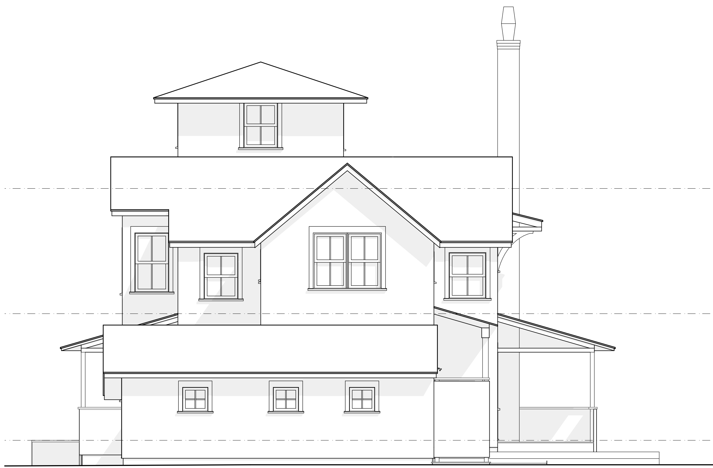
SOUTH ELEVATION - EXISTING