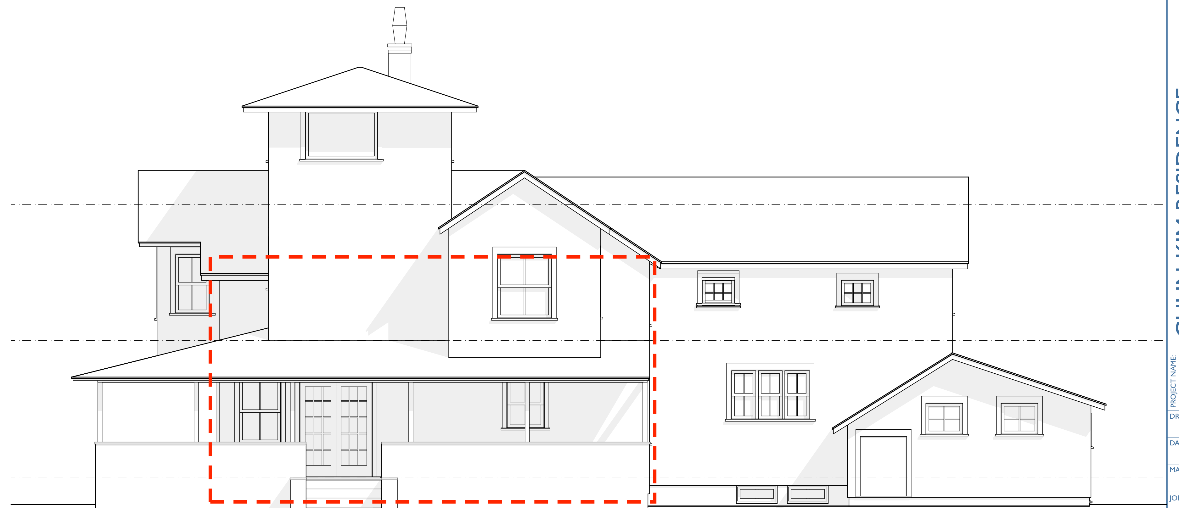
WEST ELEVATION - EXISTING