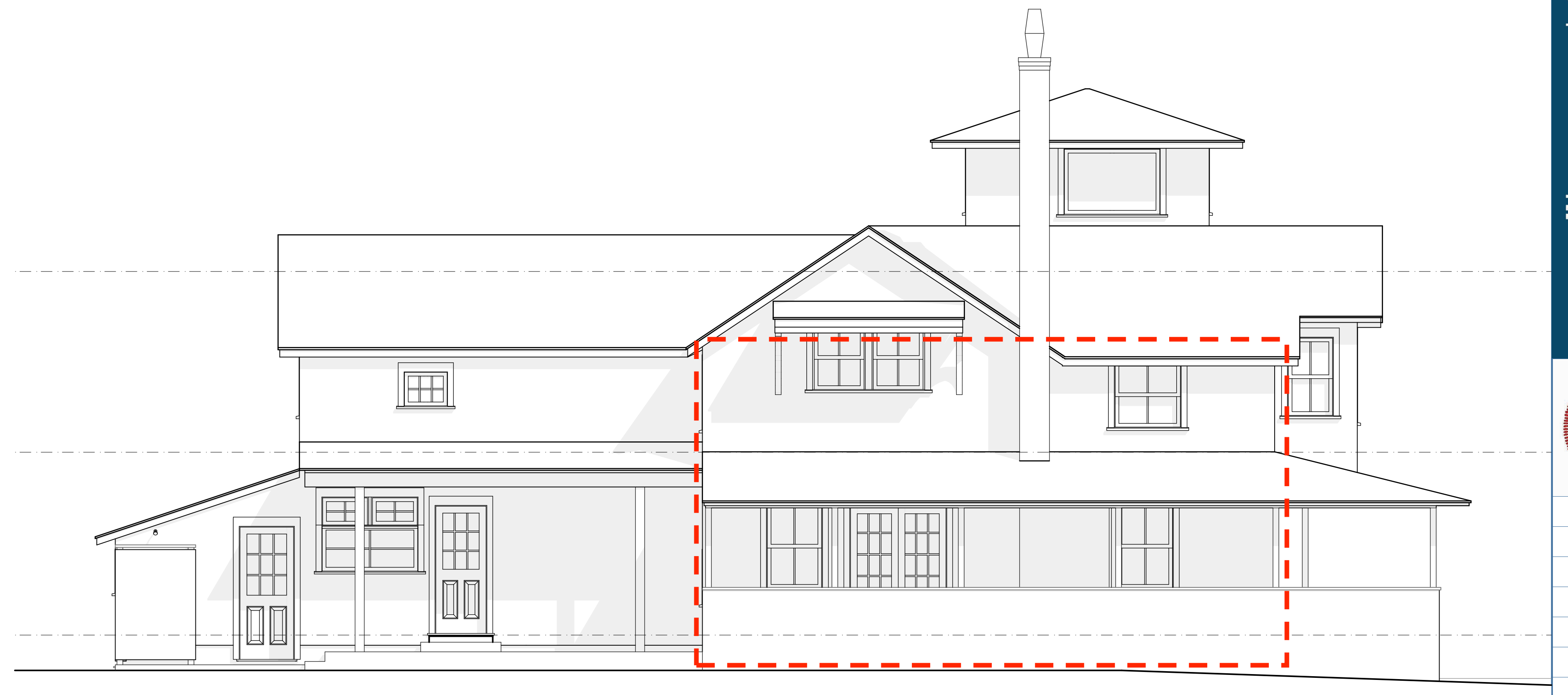
EAST ELEVATION - EXISTING