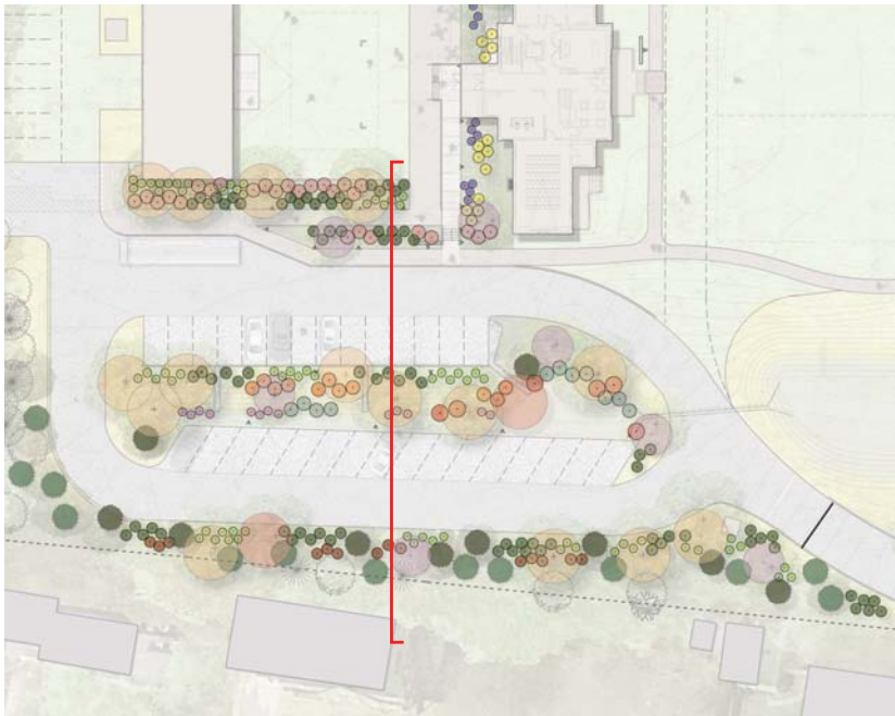
PLAN, 1" = 20'-0"