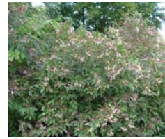
Cray Dogwood, Cornus racemosa