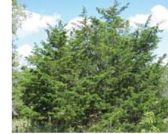
Eastern Red Cedar, Juniperus virginiana