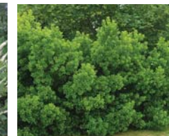
Bayberry, Myrica pennsylvanica