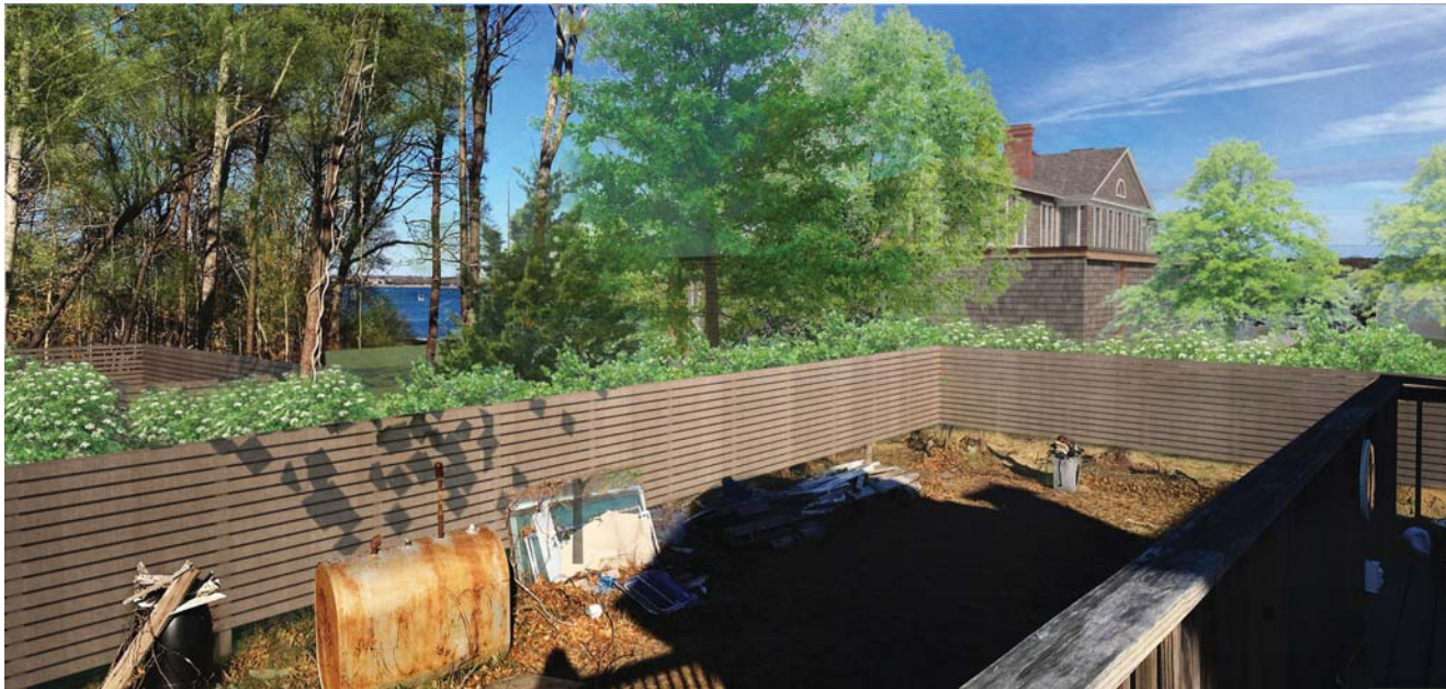
PROPOSED: PHASE 1