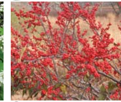
Winterberry, Ilex verticillata