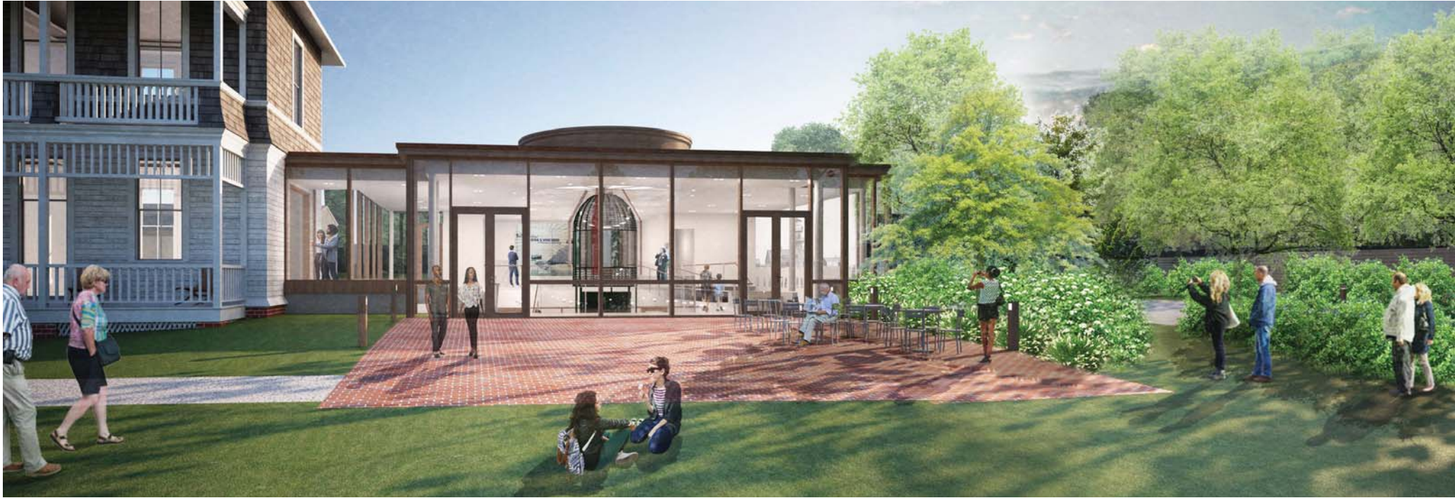
PROPOSED: PHASE 1