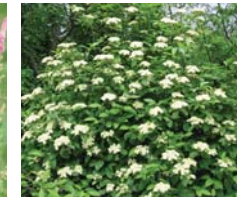
Arrowwood Viburnum, Viburnum dentatum