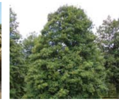
American Holly, Ilex opaca