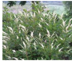
Sweet Pepperbush, Clethra alnifolia "Hummingbird"