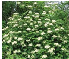
Arrowwood Viburnum, Viburnum dentatum