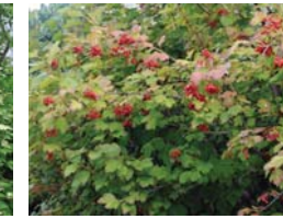
American Cranberrybush, Viburnum opulus americanum