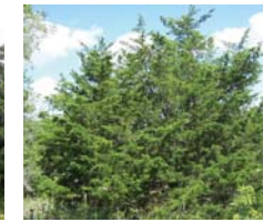
Eastern Red Cedar, Juniperus virginiana