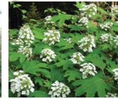
Oakleaf Hydrangea, Hydrangea quercifolia "Pe Wee"