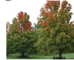
Red Maple, Acer rubrum