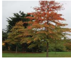
Pin Oak, Quercus palustris