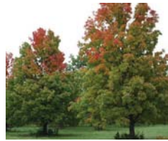
Red Maple, Acer rubrum