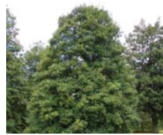
American Holly, Ilex opaca