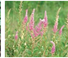
Steeplebush, Spiraea tomentosa