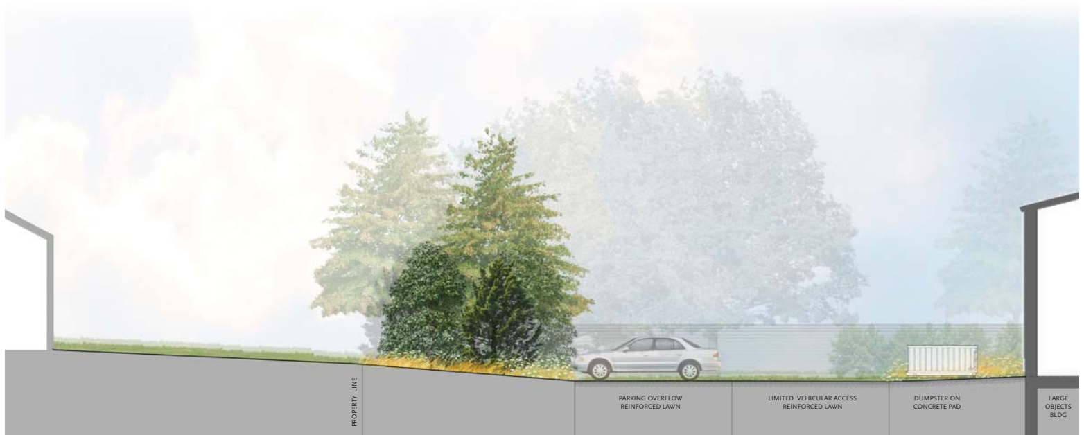
SECTION, 1/4" = 1'-0"