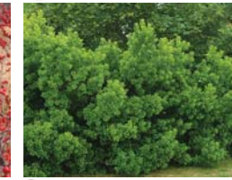
Bayberry, Myrica pennsylvanica