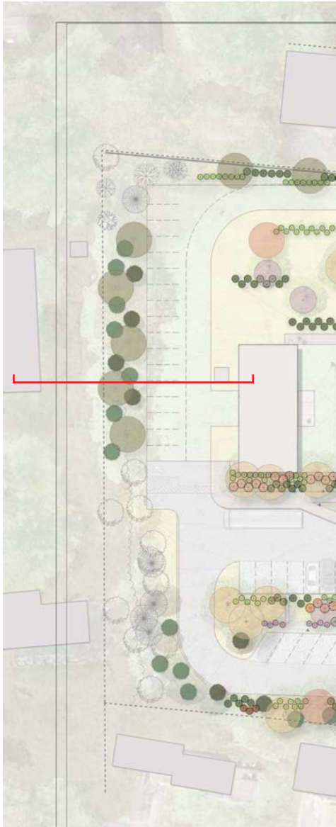
PLAN, 1" = 20'-0"