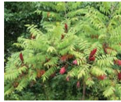
Smooth sumac, Rhus glabra