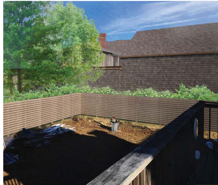
PROPOSED: PHASE 2