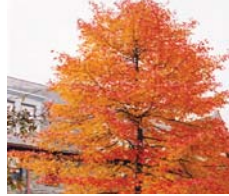
Beetlebung, Nyssa sylvatica