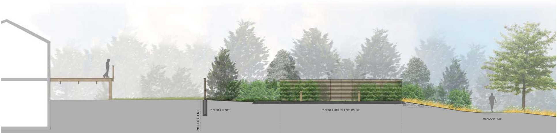
SECTION, 1/4" = 1'-0"