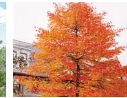
Beetlebung, Nyssa sylvatica