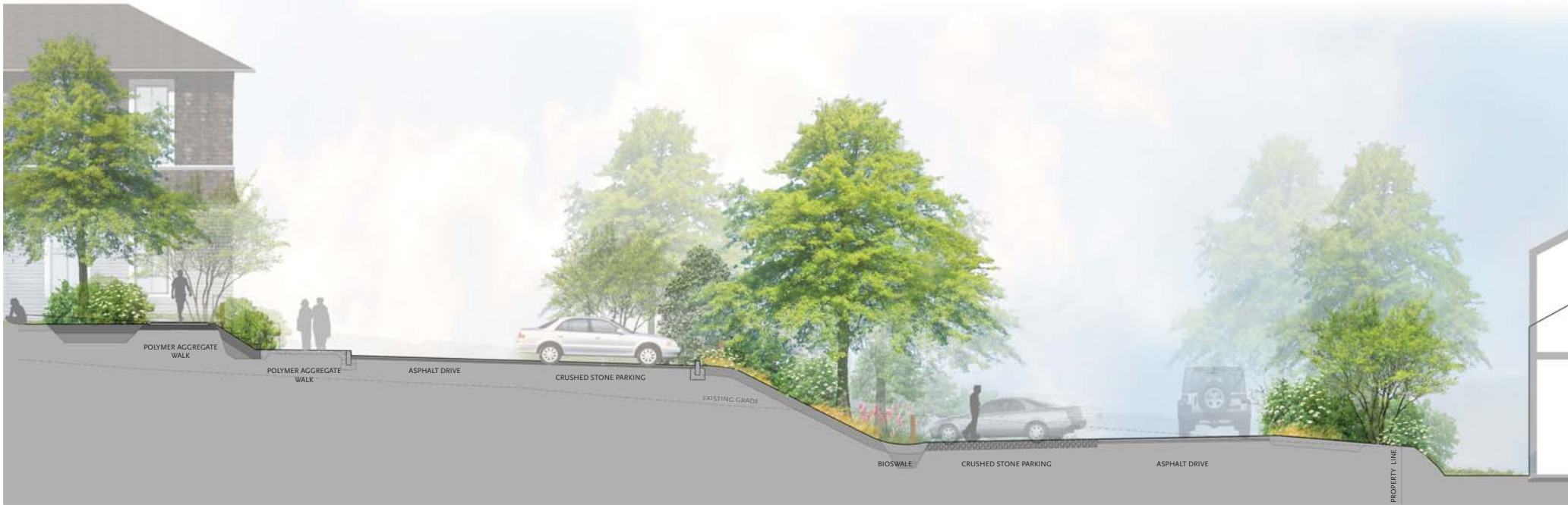
SECTION, 1/4" = 1'-0"