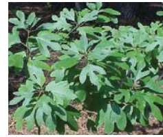
Sassafras, Sassafras albidum