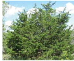
Eastern Red Cedar, Juniperus virginiana