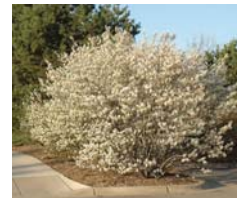
Shad, Amelanchier canadense