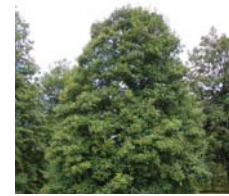
American Holly, Ilex opaca