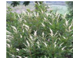
Sweet Pepperbush, Clethra alnifolia 'Hummingbird'