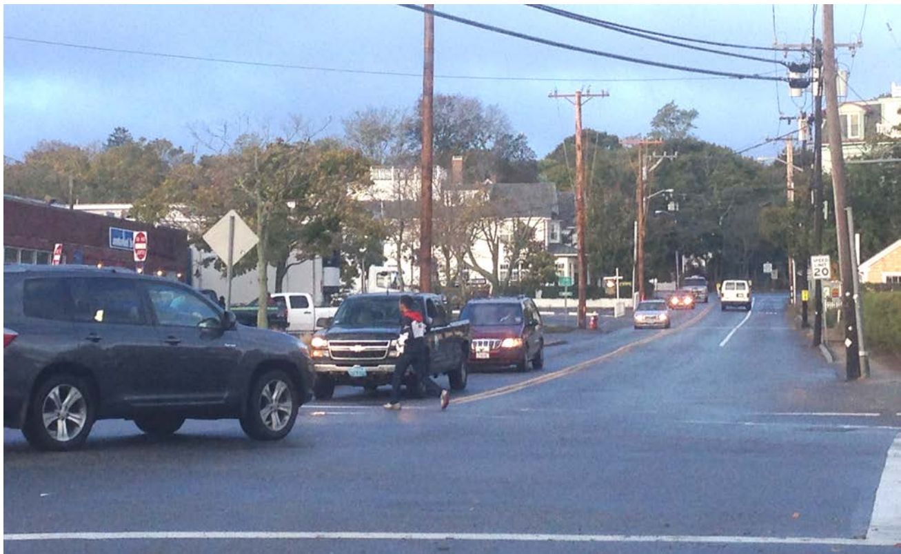
Pedestrian hurrying across one leg of Five Corners, Vineyard Haven, Oct. 2014

October 1, 2017 – September 30, 2018 Transportation Planning Activities in the County of Dukes County, Massachusetts