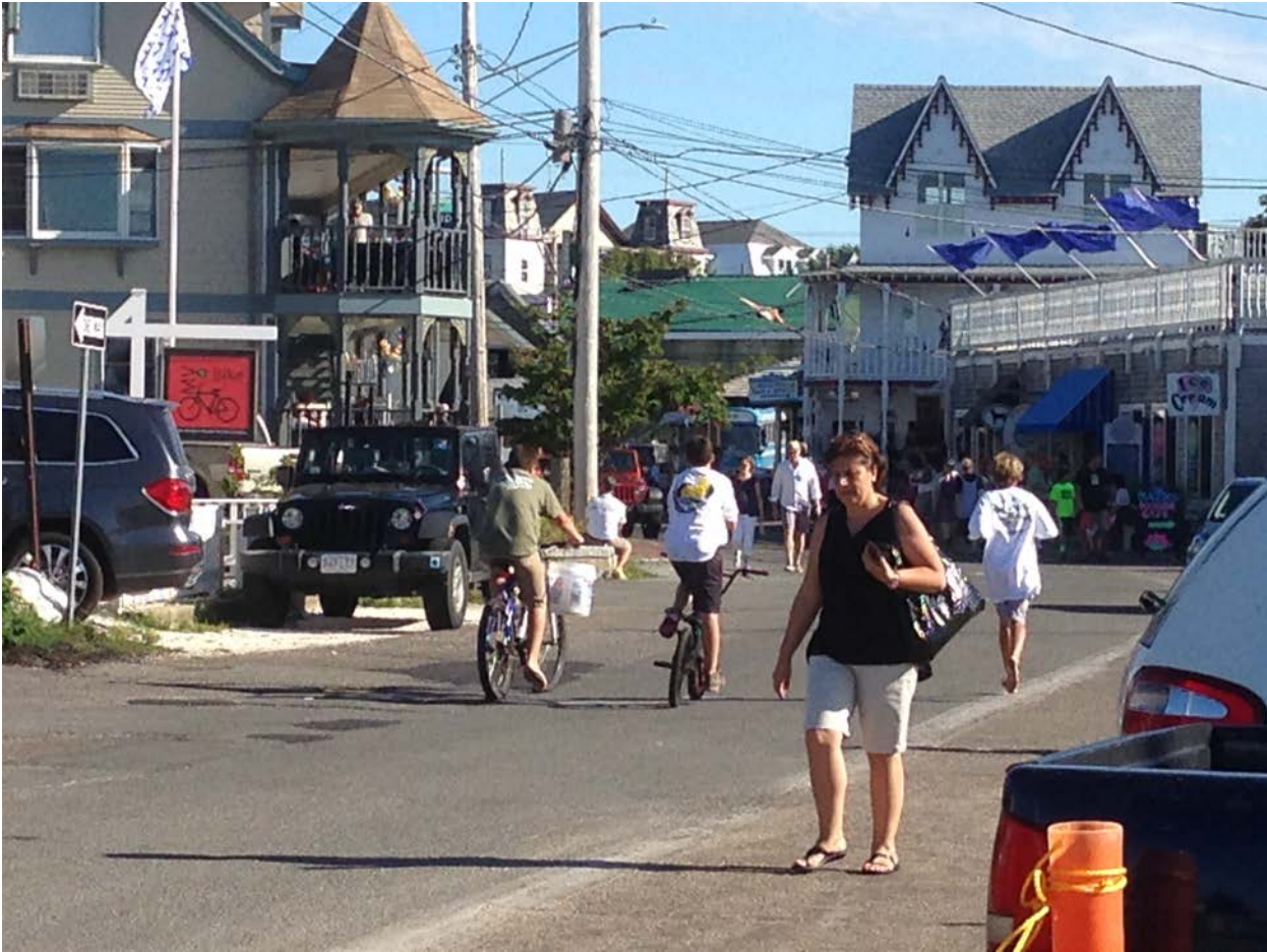
Pedestrians and Bicyclists on Circuit Avenue Extension, Oak Bluffs, August 2014

MARTHA'S VINEYARD COMMISSION BOX 1447, OAK BLUFFS, MASSACHUSETTS, 02557 508-693-3453 FAX 508-693-7894 info@mvcommission.org www.mvcommission.org